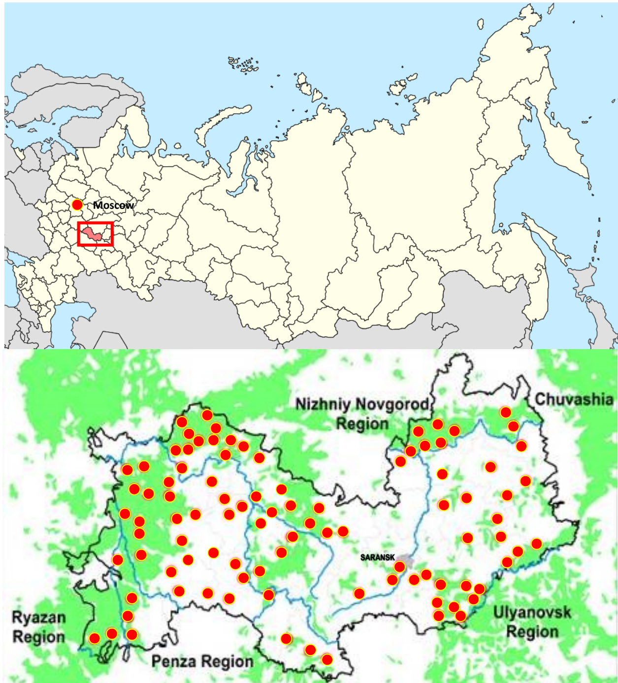
Figure 1. Study sites of click beetles in the Republic of Mordovia in 2006-2017 (red dots)

There are given references to the literature on the species from the territory of Mordovia (in case there is a reliable indication of the point of discovery it is mentioned either), new collection sites (previously unpublished information), collection date, number of collected specimens, surname of the collector, notes (if any) for each species in the annotated list below. In the absence of new unpublished material of the authors, the section "Material" is not given in the article.